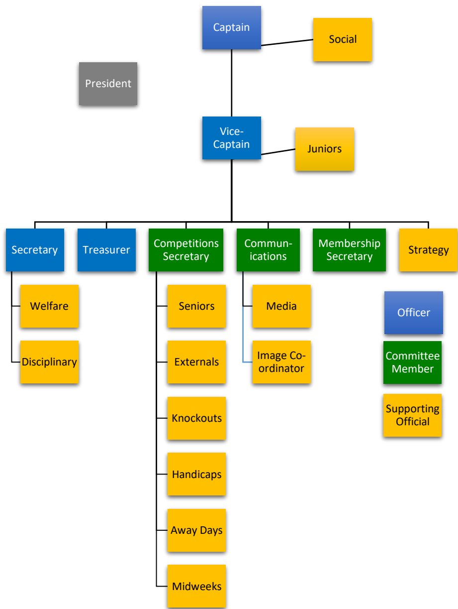
Figure 1 EGC Committee Structure